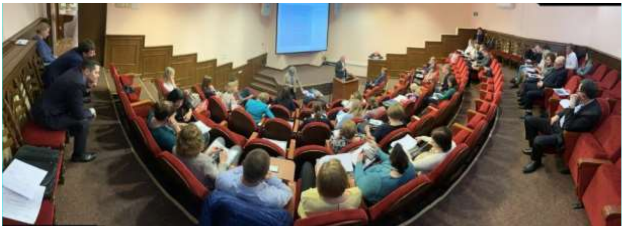
Fig 3 – Participants of Arkhangelsk Workshop