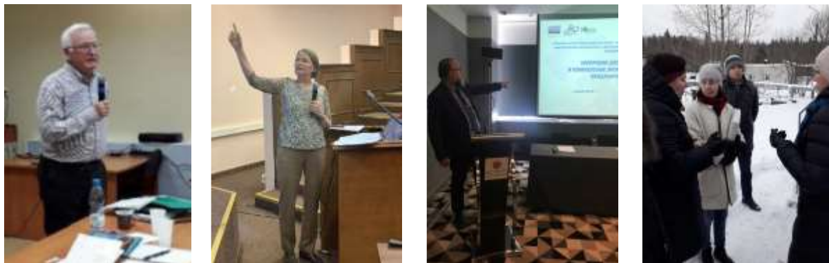
Fig. 4 – Nordic experts in Syktyvkar, Arkhangelsk, Murmansk and Petrozavodsk